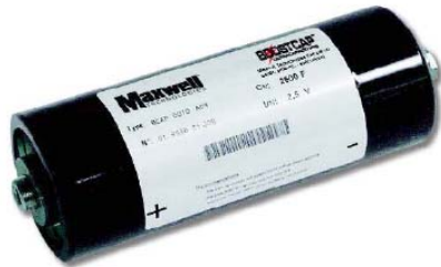
BCAP0010, 2,600 F, 2.5 V