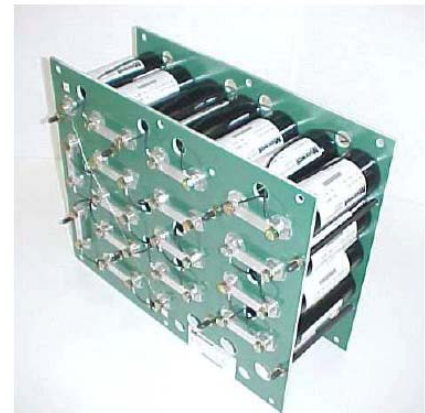
Ultracapacitor emergency power pack sub-module for MW class turbines. It contains 32 capacitors, a nominal capacitance of 19 or 81 F and a nominal voltage of 75 VDC

Manufacturers continue to reach for the stars as installations grow ever larger. Megawatt class turbines dominate much of the actual world market, pushing the average installed capacity per turbine above the 1 MW mark. Several wind power plant manufacturers are in development of multi-megawatt turbines, as the offshore market may demand such installations. The largest turbines are able to produce