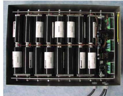
Ultracapacitor module for pitch control units containing 34 capacitors, a nominal capacitance of 76.5 F and a nominal voltage of 76 VDC

In the following example a layout of a pitch system is presented. Pitch systems are located in the rotating rotor hub of the wind turbine. The power supply and control signals for the pitch systems are transferred by a slip ring from the non-rotating part of the nacelle. The slip ring is connected to a unit, which includes clamps for distributing power, and control signals for the three individual blade drive units. Each of them consists of a switched mode power supply, a field bus, the motor converter, an emergency system, and the ultracapacitor bank. When the power supply is switched on, the ultracapacitor module is charged to its nominal voltage. Typical charging time is approximately 1 minute. The capacitor module has a high enough energy content to run the system for more than 30 seconds with nominal power. The ultracapacitor module is directly connected to the DC link of the motor converter. The converter then drives a 3-phase, 4-pole asynchronous motor that is mounted directly to the gearbox of the blade drive. The motor is designed to give a maximum torque at very low rpm. Each blade has sensors that control the blade position.