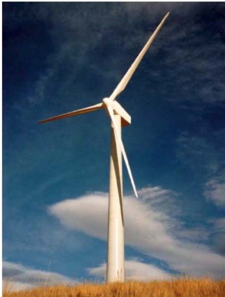
Three bladed wind turbines

Today's advanced wind turbines are three-bladed, variable speed turbines. The rotor blades are adjusted and controlled via three independent electro-mechanical propulsion units for the pitch systems. On a pitch controlled wind turbine the turbine's electronic controller checks the power output of the turbine several times per second. When the power output becomes too high, it sends an order to the blade pitch mechanism, which immediately turns the rotor blades slightly out of the wind. Conversely, the blades are turned back into the wind whenever the wind drops again. Thus aerodynamic efficiency and reduced loads on the drive train is assured, providing reduced maintenance and longer turbine life. To enhance the level of safety, newer wind turbine technology uses the wind not only to produce wind energy but also for its own safety. The converters feature aerodynamic braking by individual pitch control. The rotor attains the full braking effect with a 90 degree off position of all three blades. Even if a blade pitch unit fails, the other two rotor blades finish off the braking process safely. To enhance the level of safety each of the autonomous pitch systems is equipped with an emergency power supply to immediately ensure the reliable functioning of the fast blade pitch system in the event of a total power failure or for maintenance purposes.